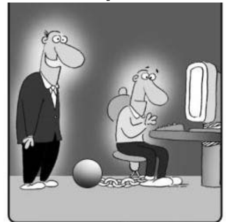
"I am sure you'll appreciate our new policy."